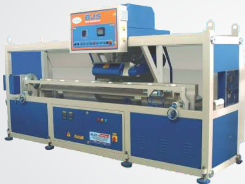
Single Pipe Slotting