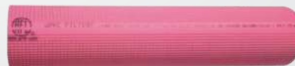
Slotting 0.2mm with Spacing 2.5mm