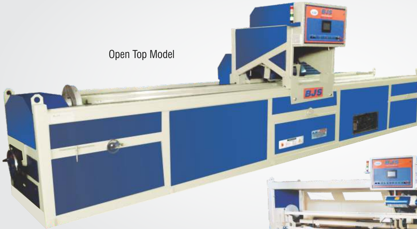
Open Top Model